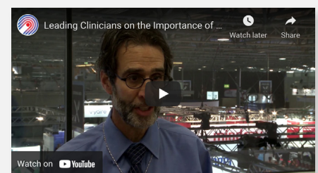
Leading Clinicians on the Importance of Nociception Monitoring