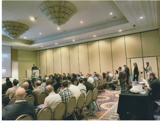
Reviewing NOL™ case studies at ICISA 2017